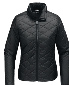
HEATSEEKER™ INSULATED LINER JACKET