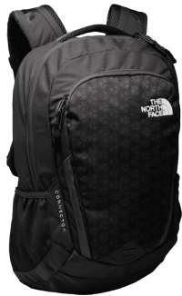
TNF BLACK/TNF WHITE