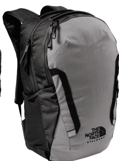
MID GREY DARK HEATHER/TNF BLACK