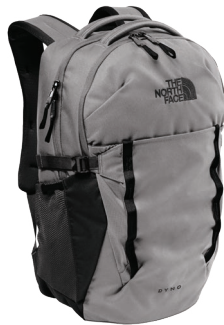
MID GREY DARK HEATHER/TNF BLACK