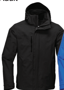
TNF BLACK/ TNF BLACK