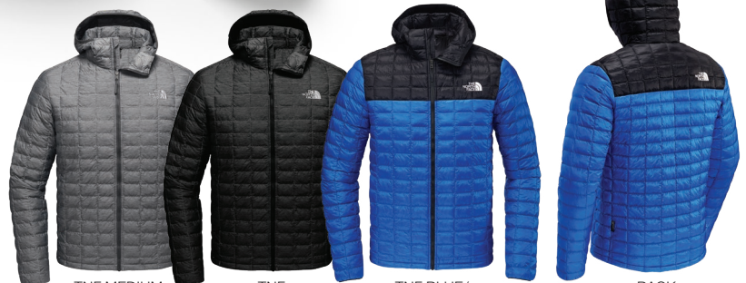
TNF MEDIUM GREY HEATHER