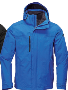
MONSTER BLUE/TNF BLACK