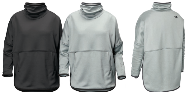
TNF BLACK HEATHER