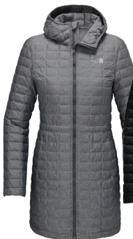
TNF MEDIUM GREY HEATHER