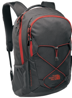
TNF DARK GREY HEATHER/CARDINAL RED