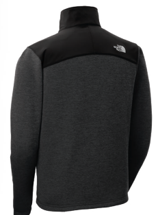
TNF BLACK HEATHER BACK