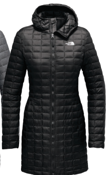
TNF MATTE BLACK