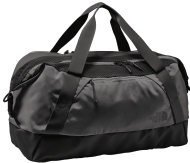
ASPHALT GREY/TNF BLACK