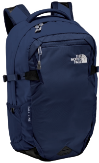
COSMIC BLUE/ ASPHALT GREY