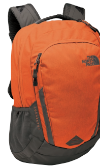
TIBETAN ORANGE/ ASPHALT GREY