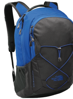
MONSTER BLUE/ ASPHALT GREY