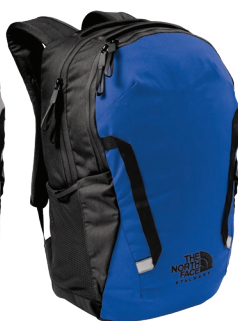
TNF BLACK HEATHER/ TNF BLUE