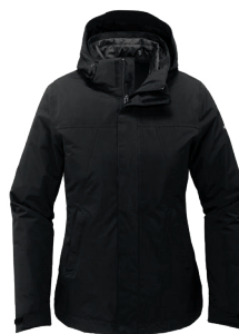
TNF BLACK/ TNF BLACK