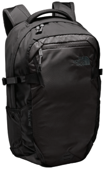
TNF BLACK HEATHER