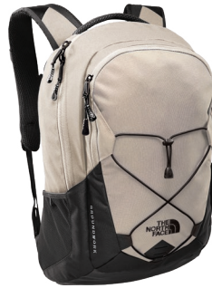
RAINY DAY IVORY DARK HEATHER/TNF BLACK