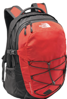
TNF RED/ASPHALT GREY