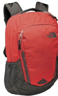
RAGE RED/ ASPHALT GREY