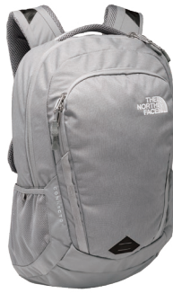
MID GREY DARK HEATHER/MID GREY