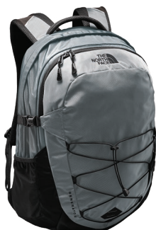
ZINC GREY HEATHER/ TNF BLACK