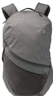
TNF MEDIUM GREY HEATHER