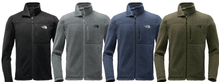
TNF BLACK HEATHER