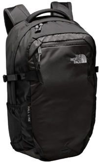
TNF BLACK HEATHER