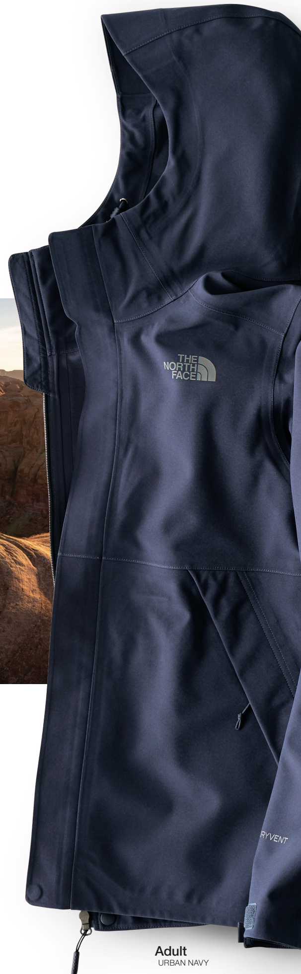
Adult URBAN NAVY