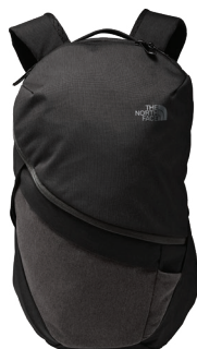
TNF BLACK HEATHER