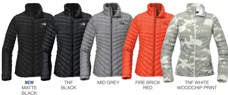
NEW MATTE BLACK