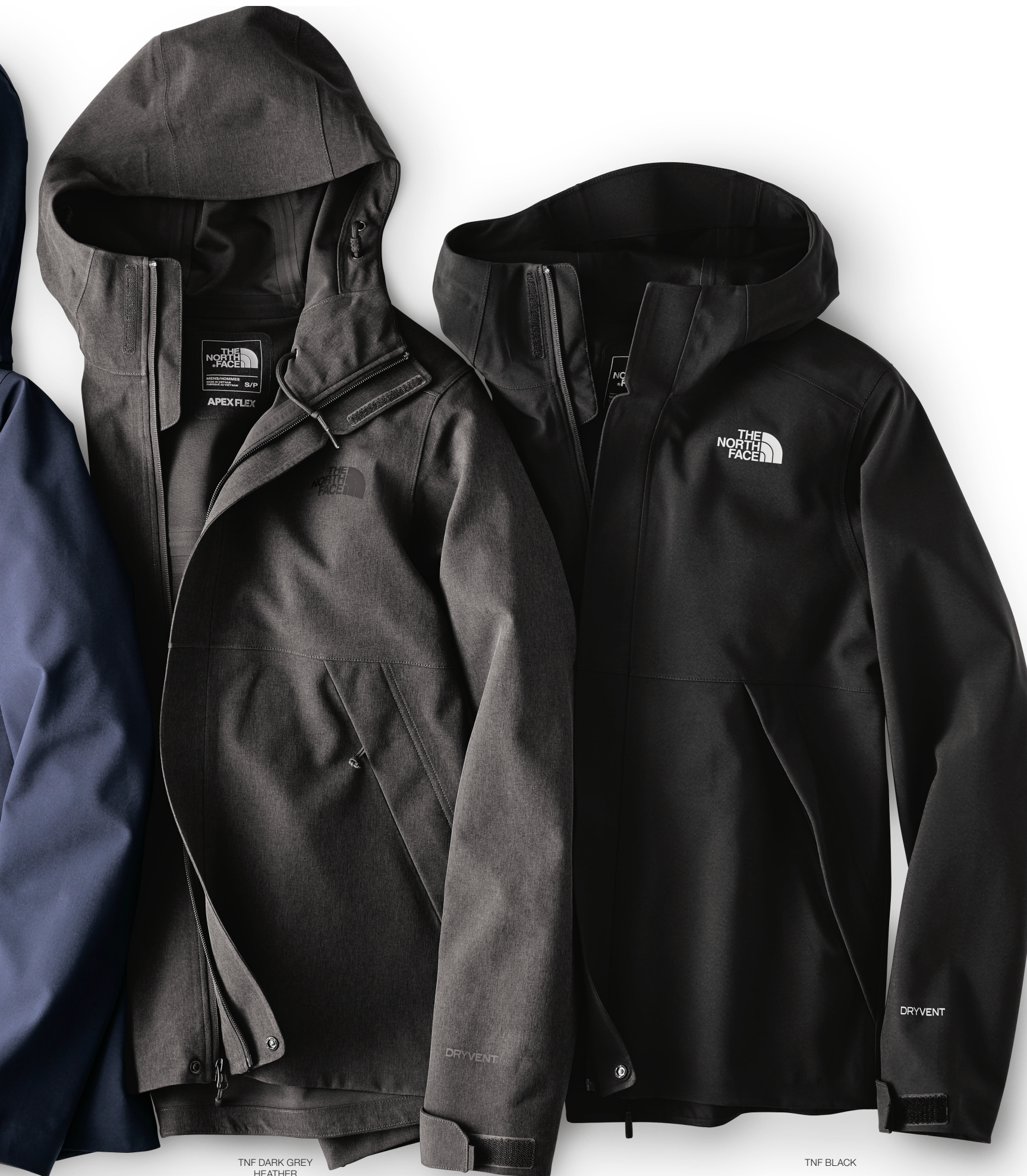
TNF DARK GREY HEATHER