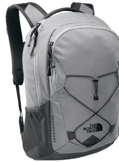
MID GREY/ASPHALT GREY