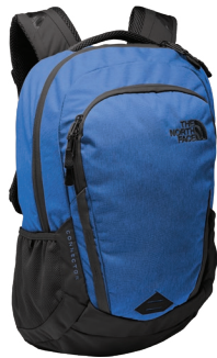
MONSTER BLUE/ TNF BLACK