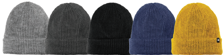
TNF MED GREY HEATHER