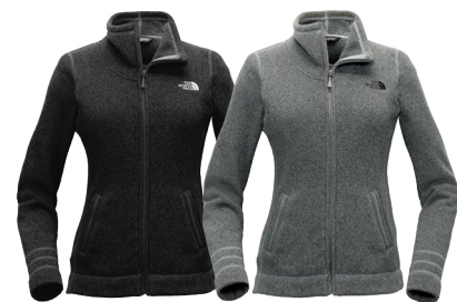
TNF BLACK HEATHER