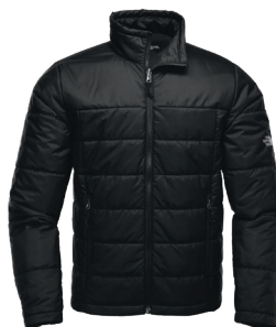
HEATSEEKER™ INSULATED LINER JACKET