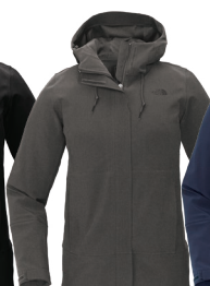
TNF DARK GREY HEATHER