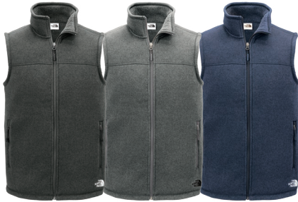
TNF BLACK HEATHER