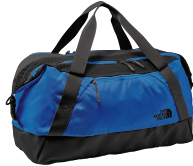
MONSTER BLUE/TNF BLACK