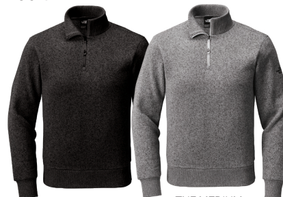
TNF BLACK HEATHER